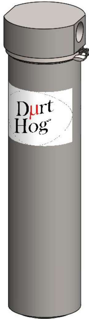
DH22 SERIES Durt Hog® ANTI-CORROSION FILTER WITH PALL MEDIA