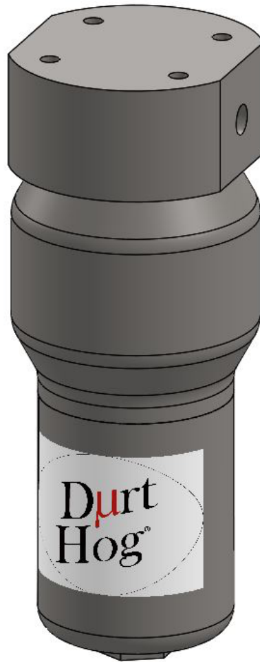
DH51 SERIES Durt Hog® ANTI-CORROSION FILTER WITH PALL MEDIA