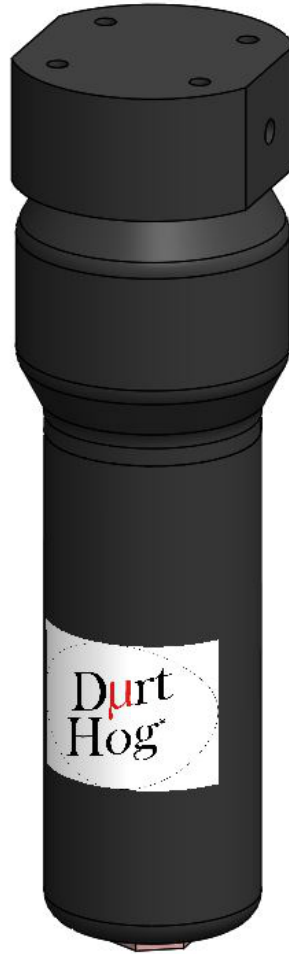
DH61/71 SERIES Durt Hog® ANTI-CORROSION ANTI-GALL FILTER WITH PALL MEDIA